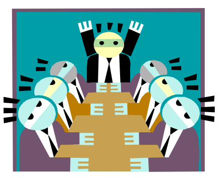
This briefing can help your senior executives become champions for diversity!

Fees include travel. Discounted rate available if multiple sessions are scheduled.